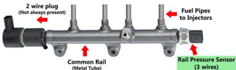
General outlook of the fuel rail in a common rail engine