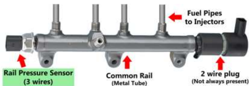
General outlook of the fuel rail in a common rail engine