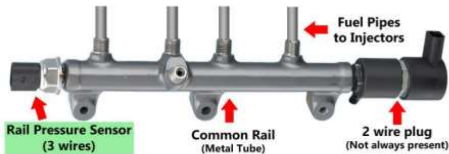
General outlook of the fuel rail in a common rail engine