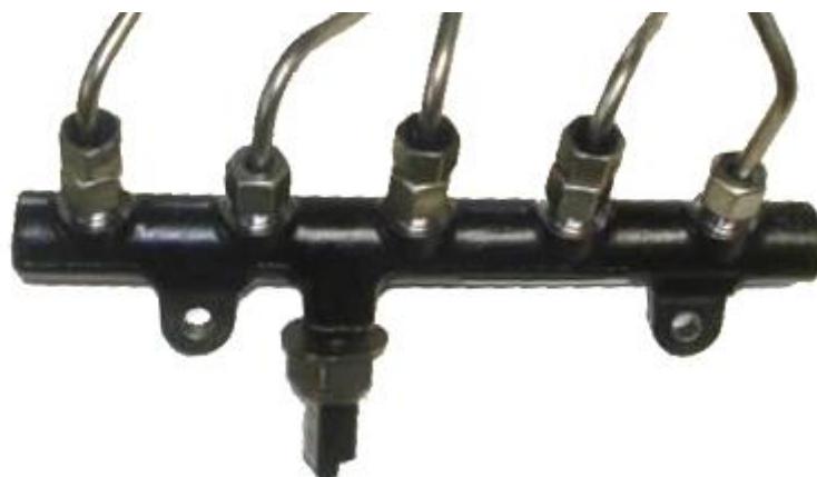
Fuel rail of a 2.0 TDCi (Rail Sensor pointing down)