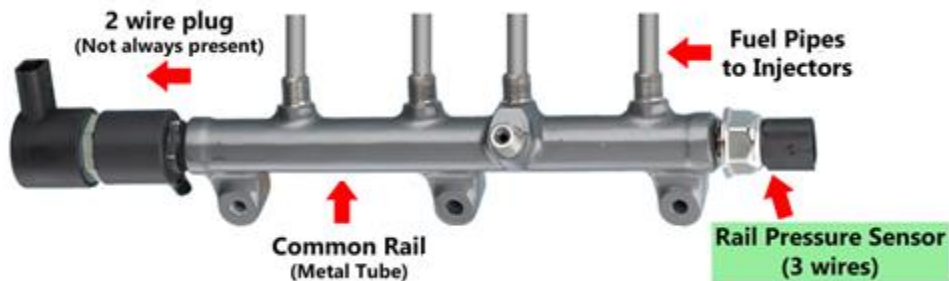
General outlook of the fuel rail in a common rail engine